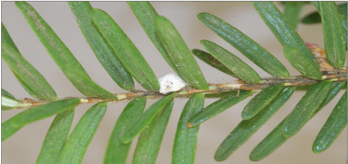
Figure 2. Individual woolly mass on hemlock twig.

these both contribute to the spread of HWA. Hemlock forest stands within 100 km of the Canada/US Border should be given priority over other wild sites.